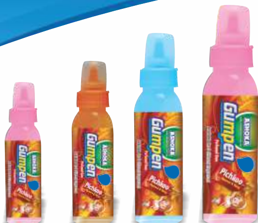
AGP234 AGP236 AGP237 AGP238